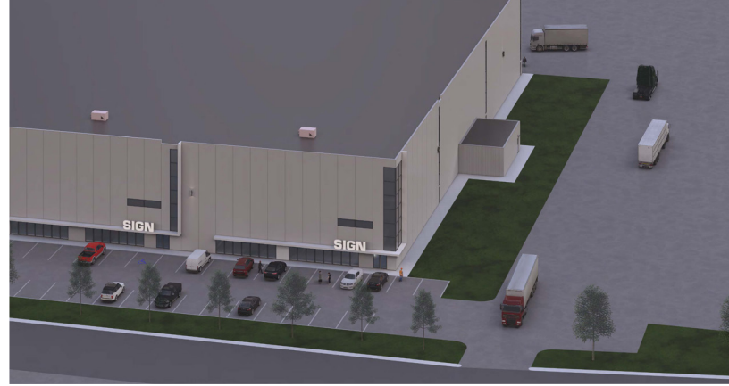
Concept Site Plan