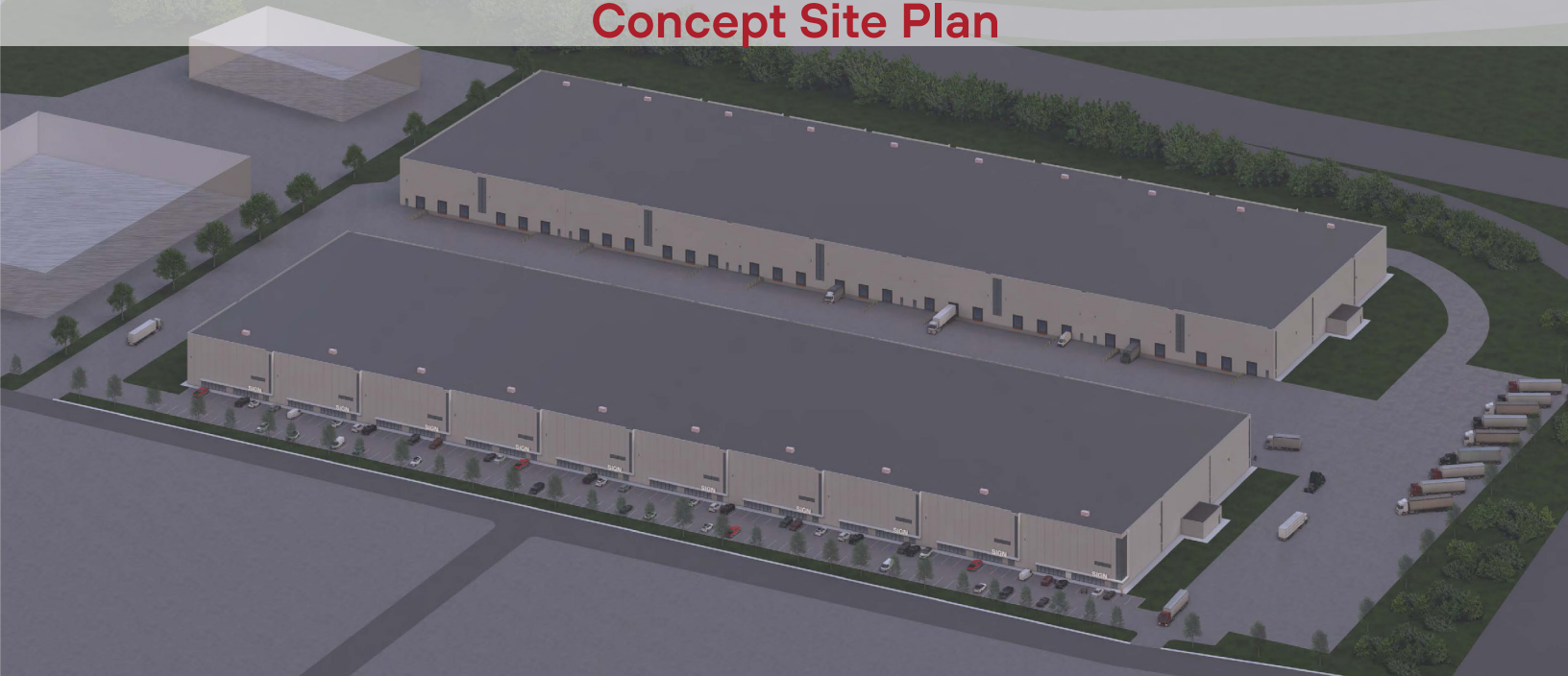
Concept Site Plan